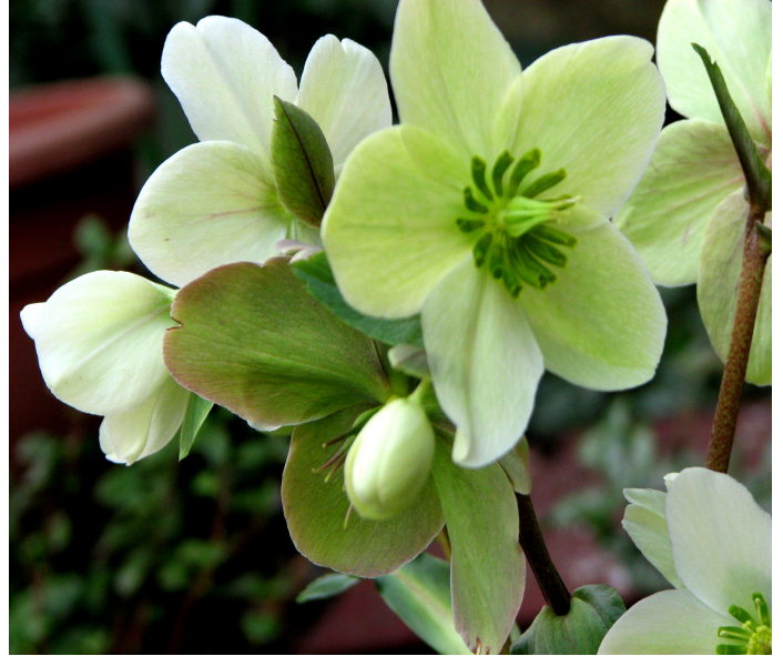
Vancouver Medallion 2010 Helleborus x nigercors

Scented shrubs: Some shrubs flower in winter, such as witch hazel ( Hamamelis ) with its orange, yellow, or red, spider-like blooms. Other shrubs worth considering for their delicious scent include the honeysuckle Lonicera x purpusii and Chimonanthus praecox .